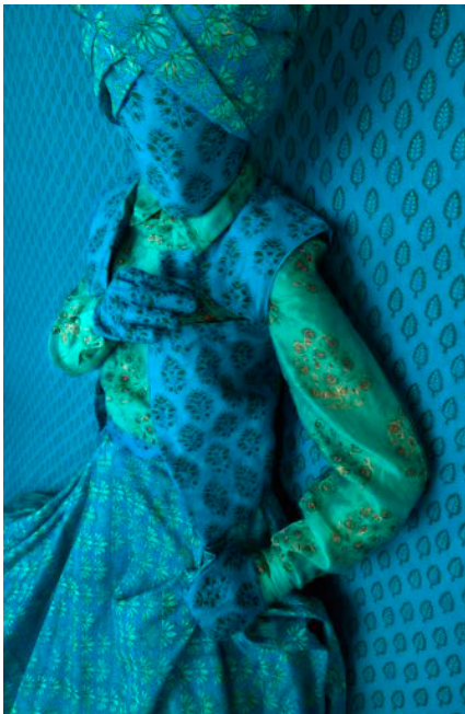
Alia Ali, Peak (2024) Archival pigment print, mounted, UV laminated, frame upholstered by the artist in hand-printed wood block Rajasthani, 66 x 45, 1/2 x 3 inches

The works on view engage in a dynamic dialogue around rhythm, migration, memory, and place, forged through an exchange between New Orleans and London - two cities deeply rooted in layered musical histories. Rhythm in the Blues draws from the cultural and historical legacy of Rhythm and Blues as an art form shaped by movement, resilience, and lived experience. Through repetition, tonal variation, and intuitive form, the artists explore rhythm as both structure and inheritance, reflecting on diaspora, identity, and the transmission of memory. The result is a resonant visual language that invites viewers to not only see but feel the enduring pulse of history.