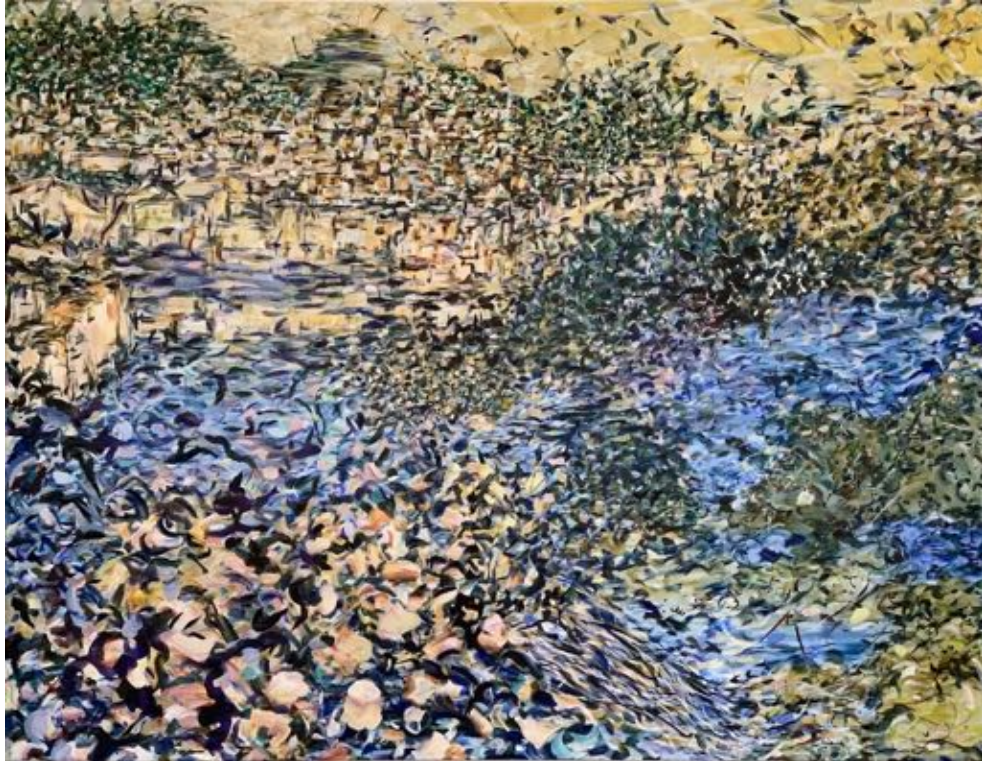
Naomie Kremer, Cyclades (2015) Oil on linen 61.5 x 78.5"