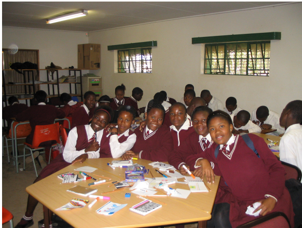
TMTR Outreach Project – Mamelodi Township, S. Africa