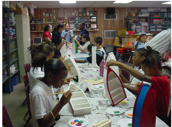
TMTR Outreach Project – Wichita Falls, Texas