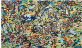
Naomie Kremer Sage 2012 Oil on linen 117.5 x 200.5 cm (46 1/4 x 79 inches) £18,000