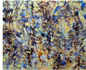
Naomie Kremer Twister 2010 Oil on linen 17.8 x 114.3 cm (35 1/2 x 45 inches) £7,200