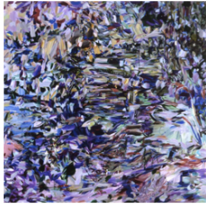
Naomie Kremer Blue Note 2007 Oil on linen 119.4 x 119.4 cm (47 x 47 inches) £10,500

A suite of abstract oil paintings by Israeli-born American artist Naomie Kremer , with their jagged, geometric forms, create a disorienting perceptual experience, an ambiguous atmosphere inviting the viewer to get lost and allow new, free associations to form in the mind. Although largely abstract, Kremer's imagery draws from the real world, incorporating references to nature, architecture, language, letterforms and the human figure. Her work is informed by art history, music, poetry and literature.