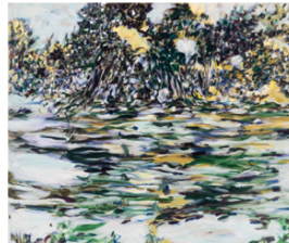
Naomie Kremer Nikiti II 2010 Oil on linen 109.2 cm x 129.5 cm (43 x 51 inches) £10,500