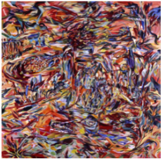
Naomie Kremer Red Squared 2008 Oil on linen 119.4 x 119.4 cm (47 x 47 inches) £10,500