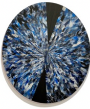
Azadeh Ghotbi Puzzling Story 51 2020 Acrylic on canvas Oval - 122 x 106 cm, (48 x 41 3/4 inches) £6,000