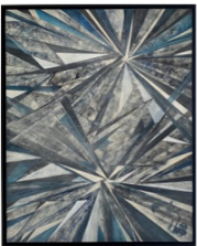
Azadeh Ghotbi Convergence Map 4 2021 Acrylic on canvas 152 x 122 cm (60 x 48 inches) £8,500 (£8,950 framed)