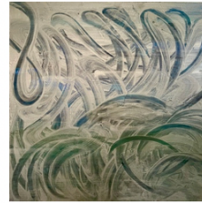
Azadeh Ghotbi Untitled 2023 Acrylic on canvas 100 x 100 cm (39 x 39 inches) £4,500