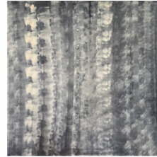
Azadeh Ghotbi Untitled 2026 Acrylic on canvas 100 x 100 cm (39 x 39 inches) £4,500