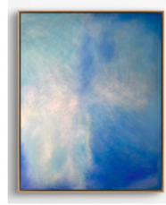
Aigana Gali KOK DALA 2025 Acrylic, Oil on Canvas 160 x 130 cm (63 x 51 1/4 inches)