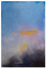
Aigana Gali TAN ATA 2014 Acrylic, Oil on Canvas 182 x 122 cm (71 1/2 x 48 inches)