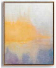
Aigana Gali KOLSAY 2014 Acrylic, Oil on Canvas 160 x 130 cm (63 x 51 1/4 inches)