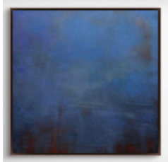
Aigana Gali ARAL I 2015 Acrylic, Oil on Canvas 180 x 180 cm (71 x 71 inches)

For the Georgian Kazakh painter Aigana Gali , meanwhile, ancient cosmologies such as Tengrism, inform luminous abstract canvases that evoke the vastness, light and mythic landscapes of the Eurasian Steppe. Her work explores colour, spirituality and human connection to nature through expansive, atmospheric forms. Gali's paintings, shown internationally - including at the Saatchi Gallery and the Royal Academy of Arts - blend intuitive gesture and movement, like a musician improvising with an instrument.